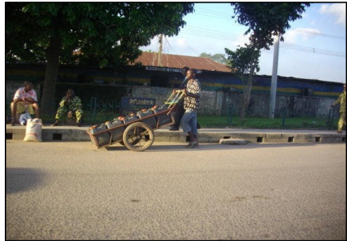
Plate 2: A metal cart used to supply water