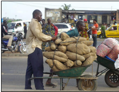
Plate 1: Wheel Barrow