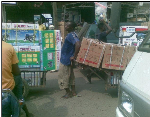
Plate 4: Cart pusher at Alaba International Market

Also, the study observed that some cart pushers go beyond the immediate vicinity of the markets where they usually operate (plate 5), for instance many cart operators ply the Badagry expressway to convey goods that commercial pickup vans would not want to convey because of the amount the ware owners are willing to pay. Also, cart owners have been seen to move from Mile 12 market to Ikorodu to sell yams. The cart operators convey such wares for half the amount the vans would want to charge.