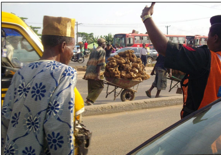
Plate 2: Cart Pushers compete with other road users