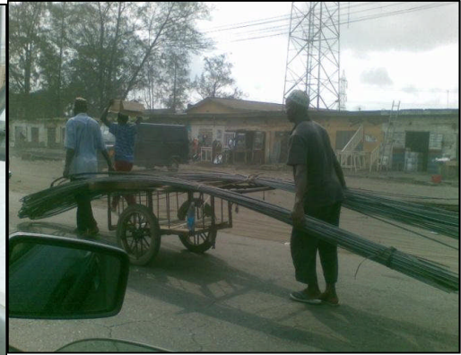
Plate 5: Carts used to convey construction rods