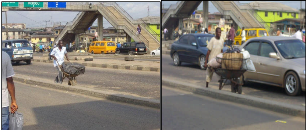
Plate 10: Cart pusher competing for road space with motorists