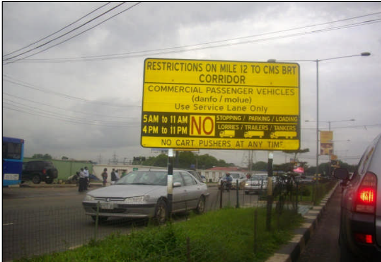
Plate 1: Cart Pushers are not recognized as road users